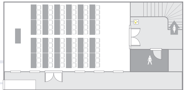
Lower ground floor